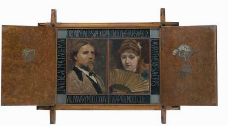
Triptych with the portraits of Lourens and his wife, Laura Epps, 1871.