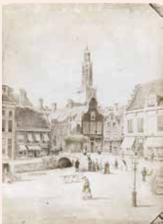
View of the Sint Jacobstraat and the Naauw (probably from the artist's living room), circa 1860.