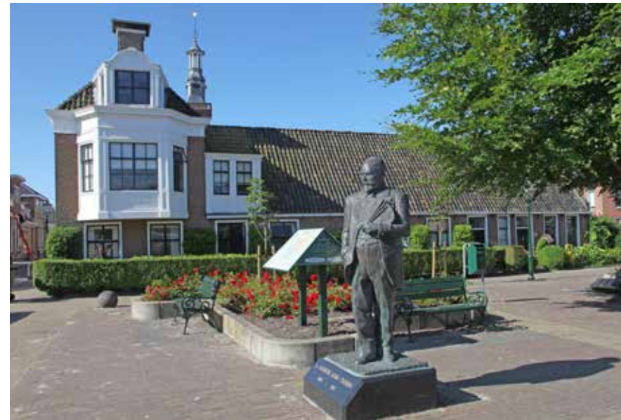
The birthplace of Alma Tadema, with his statue in the foreground.