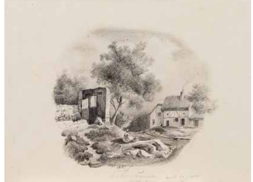
Page with two drawings of ruins, 1847.