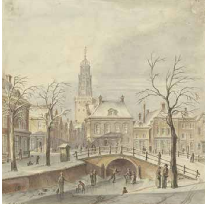
View of winter from the Groentemarkt on the Brol (bridge) and the Grote Hoogstraat, with the Nieuwe Toren (tower) in the background, circa 1850.