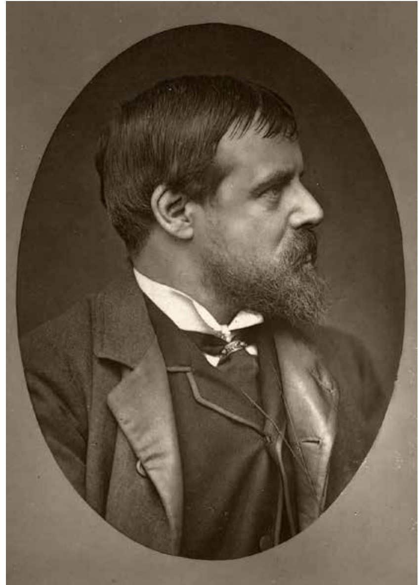
Portrait photo of Lourens Alma Tadema, circa 1875.