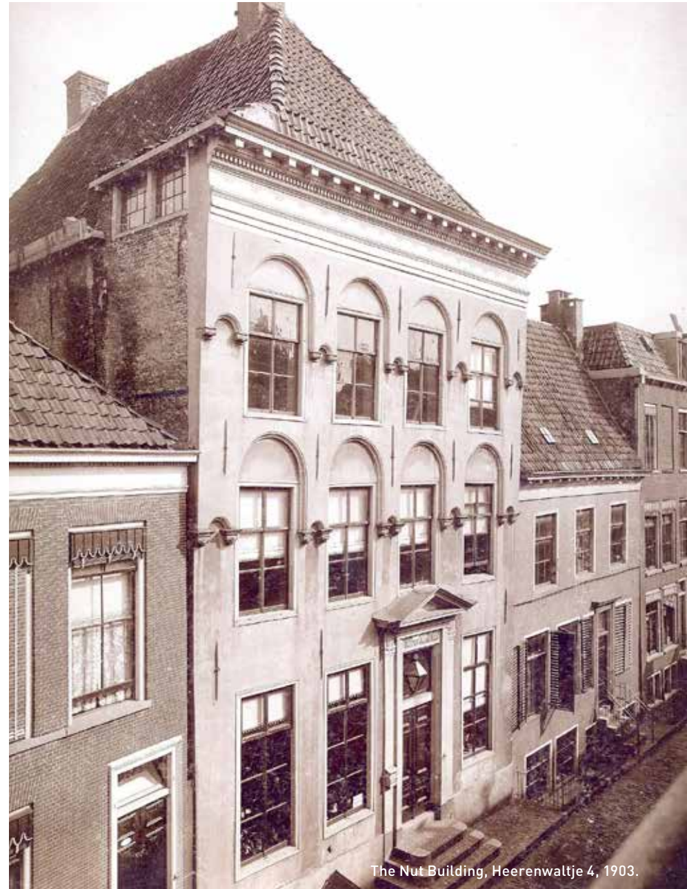
The Nut Building, Heerenwaltje 4, 1903.

The Nut bought the former Walta House, in the center of Leeuwarden, in 1825. It was used by the Nut until 1903, when the Joosten firm bought it and had it torn down to make room for the expansion of its drapery shop on the Nieuwestad. Zeeman Textiles is currently located here.