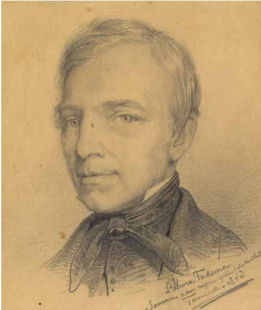
Self-portrait of Lourens Alma Tadema, drawing, 1858. TRESOAR COLLECTION