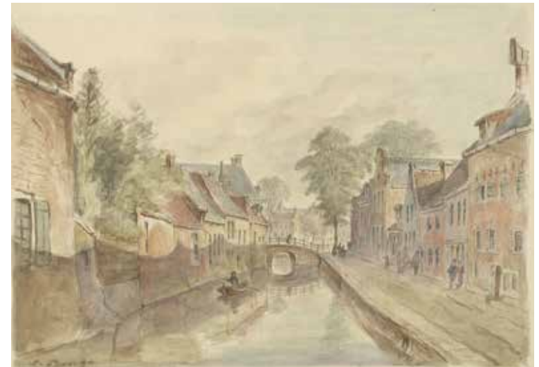
The Zwitserwiltje, with to the left the gardens and annexes of the Uniabuurt, 1840. WATERCOLOUR: S. BONGA

Uniabuurt 8 is a well-known address to the people of Leeuwarden: the De Ossekop Café (formerly the Eygelaar Café) has stood here for over 100 years.