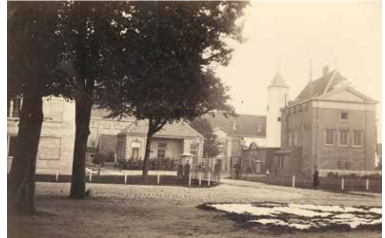
The main building of the old prison (where the Blokhuispoort now stands), as seen from nearby the Tadema family's second residence, circa 1868.