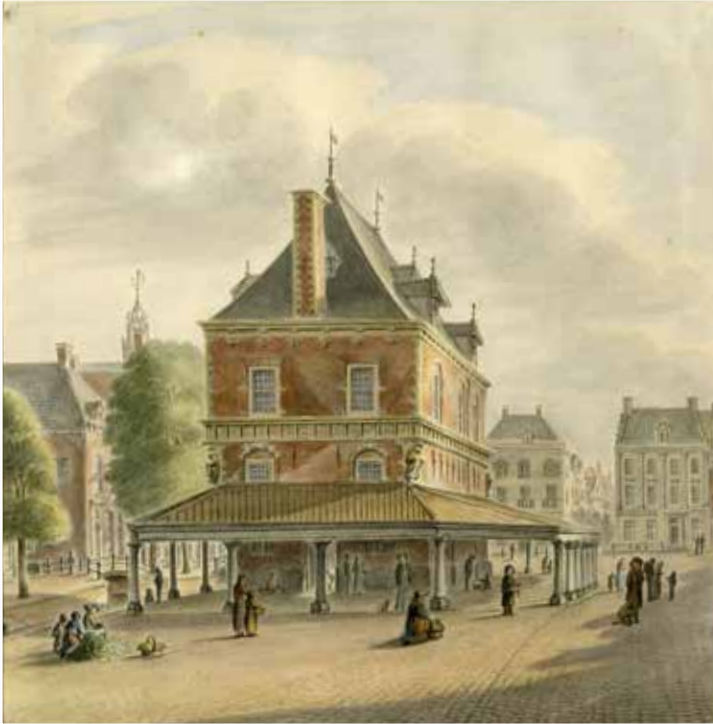
View of the Waag (weigh house), with on the right the Keizerskroon (on the corner of the Peperstraat), 1838.