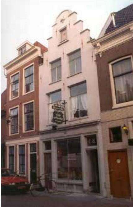
Uniabuurt 8, 1995.