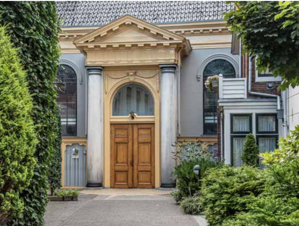
Doopsgezinde kerk (Mennonite church) on the Wirdumerdijk.

The Tadema family had become a member of the Mennonite parish in Leeuwarden when they lived in Dronrijp. They attended this church on the Wirdumerdijk. Built in 1760, this building, like many in Leeuwarden, underwent a number of large changes in the 19 th century. In 1832 it was given a Neo-Classical portal and the property between it and the Wirdumerdijk was torn down, allowing an unimpeded view of the church from the street. In 1837 the church was given a new pew arrangement and an oak wood wainscoting, and in 1850 the building was enlarged once again. Alma Tadema was baptized here.