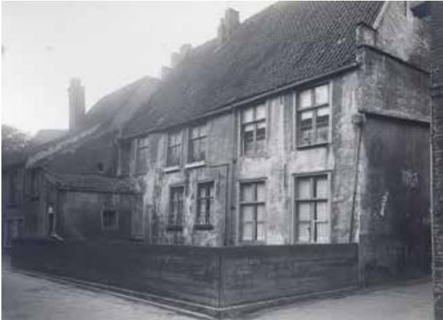
The Sint Anthonystraat, on the corner of De Zak, circa 1920, about where the Stadsburgerschool once stood.