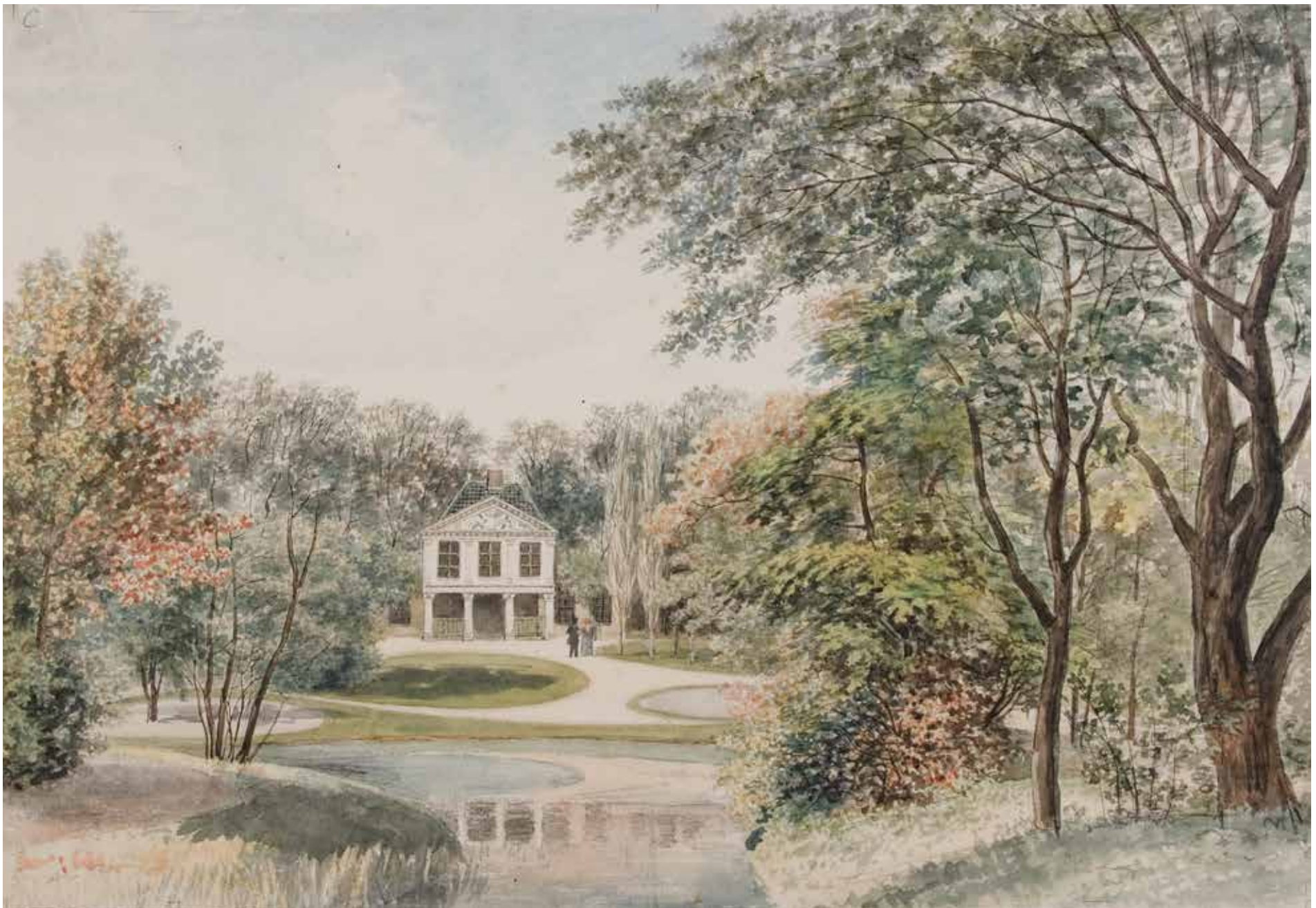
De Prinsentuin te Leeuwarden, omstreeks 1820.

WATERCOLOUR: E. J. EELKEMA (1788-1939) FRIS MUSEUM - ROYAL FRISIAN SOCIETY COLLECTION