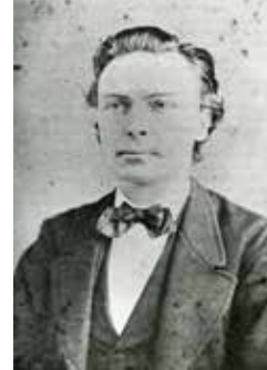
François HaverSchmidt, circa 1865.

their time together at school. François came to Leeuwarden in 1871 to give a lecture for the local afdeling van het Nut (Society for Public Welfare). On this occasion he praised the new railway connection and was pleased that the old city dialect was still very much alive.