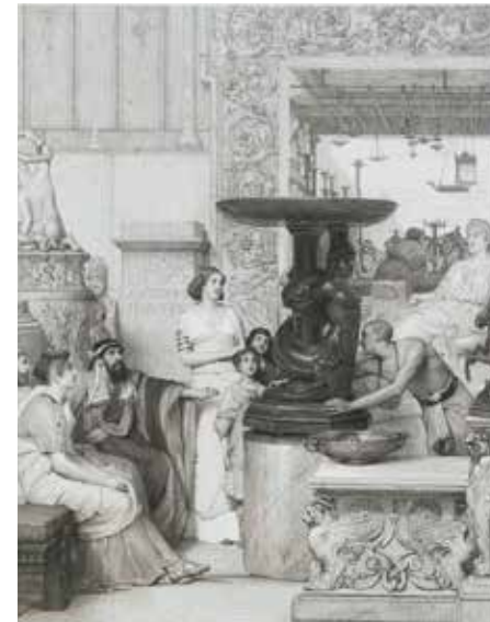
The Sculpture Gallery, 1871.