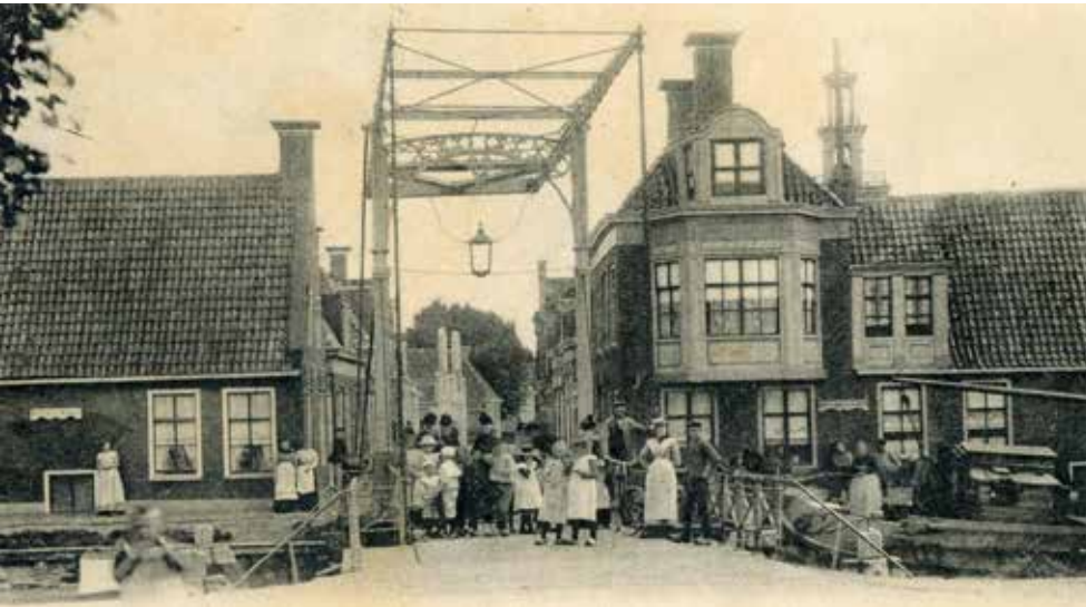
The birthplace of Alma Tadema in Dronrijp, with the bridge over the Harlinger Trekvaart (tow-canal) in the foreground, circa 1900.