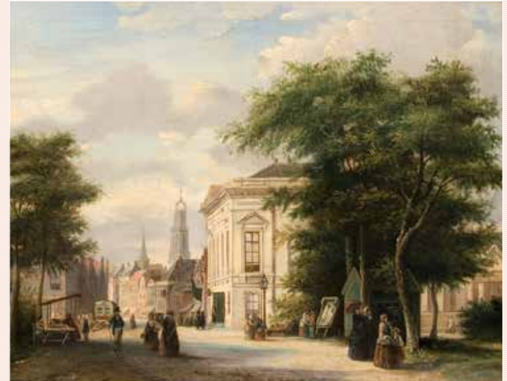
View of the Wirdumerdijk, with in the middle the Sociëteit Amicitia, 1854.