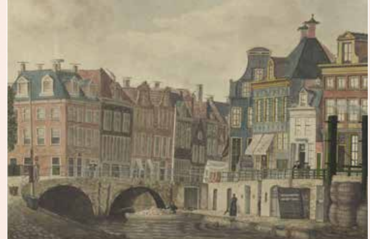
The Kelders, Naauw and Bierkade, with the chimneys of the hat factory, circa 1830.