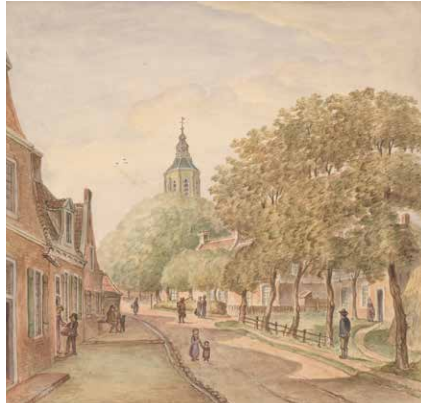
View of the Tsjerkebuorren in Dronrijp, Sjoerd Bonga, watercolour, 1853.

The tower of the Sint Salviuskerk (St. Salvius church), informally called " d'Alde Wite " (Old White Church)) dominated the skyline then as it does now. It was built in the 12 th century but received its present exterior in 1504, when the building was expanded and the choir and south wall were given Gothic characteristics, like pointed arch windows. The tower, built in 1544, has a square substructure with a staircase tower inside and above that a six-sided lantern with a crowning. The church has a beautiful interior, including pew boxes,